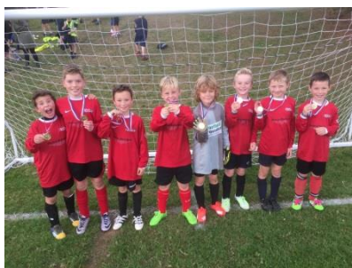
Our A team celebrating their success!