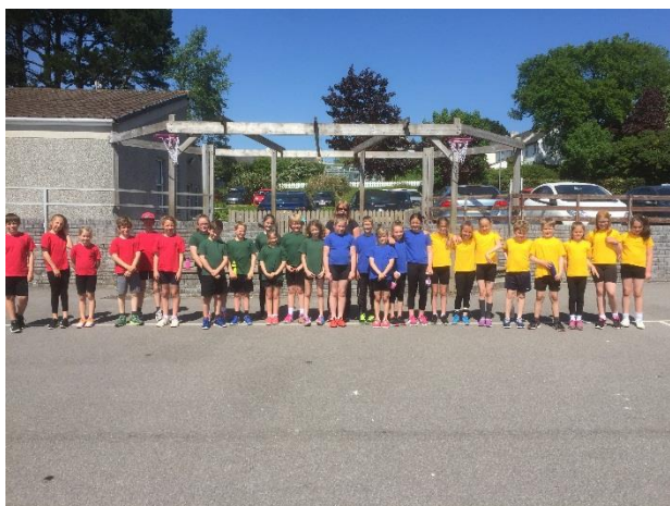
All the Y5 Teams