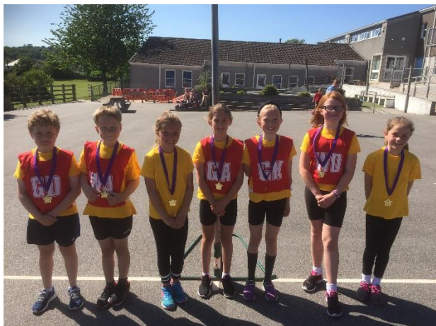
Winning Team – Tennison!